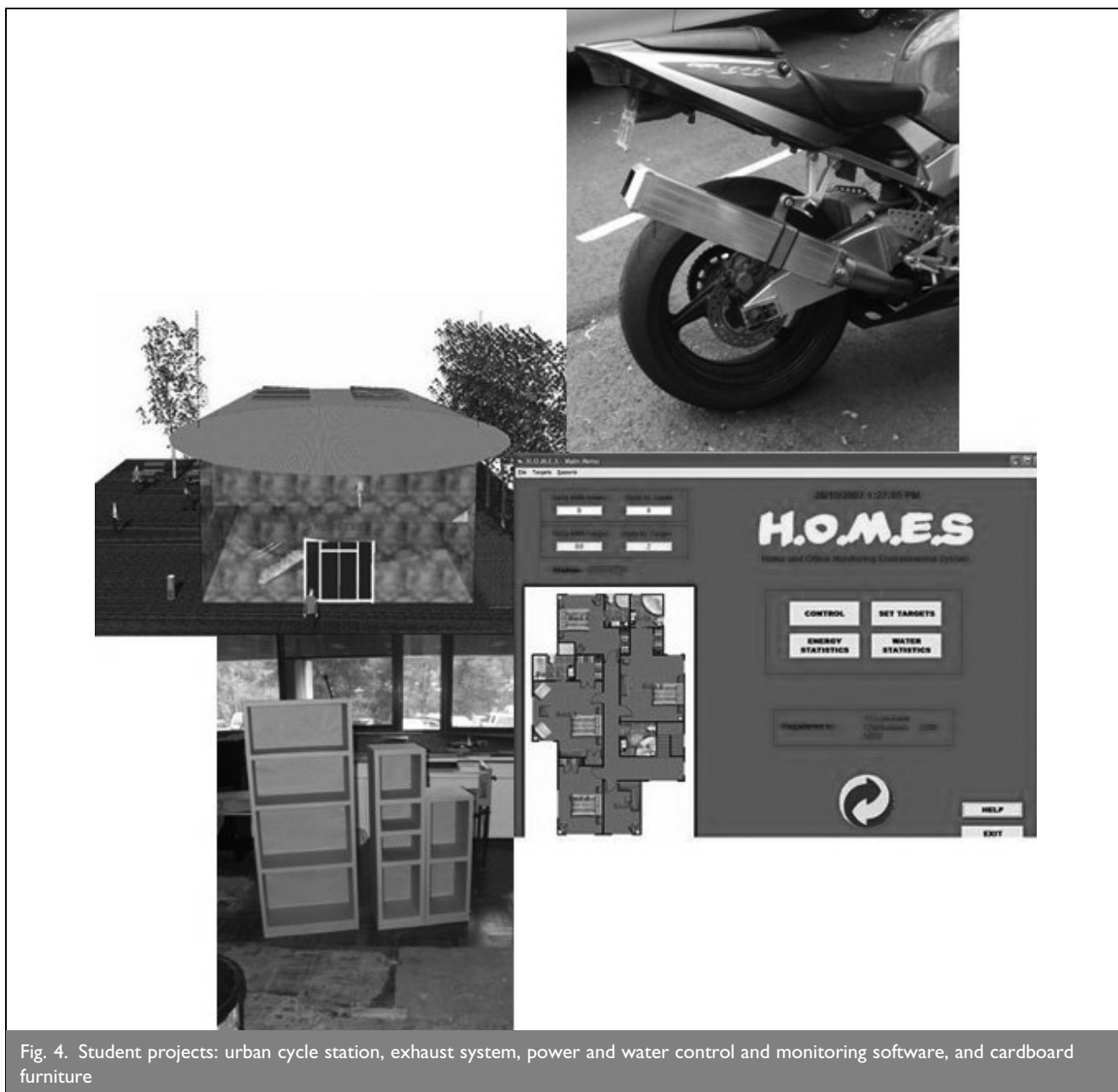
Fig. 4. Student projects: urban cycle station, exhaust system, power and water control and monitoring software, and cardboard furniture

awareness and most particularly the impact it had on their intentions with regard to professional practice returned highly favourable results. Comparison with SEC results of the previous course was particularly encouraging, justifying the course redesign. It should be noted that while the response rate from external students was disappointing, thus limiting its usefulness, it was not unusually low relative to other distance learning courses.